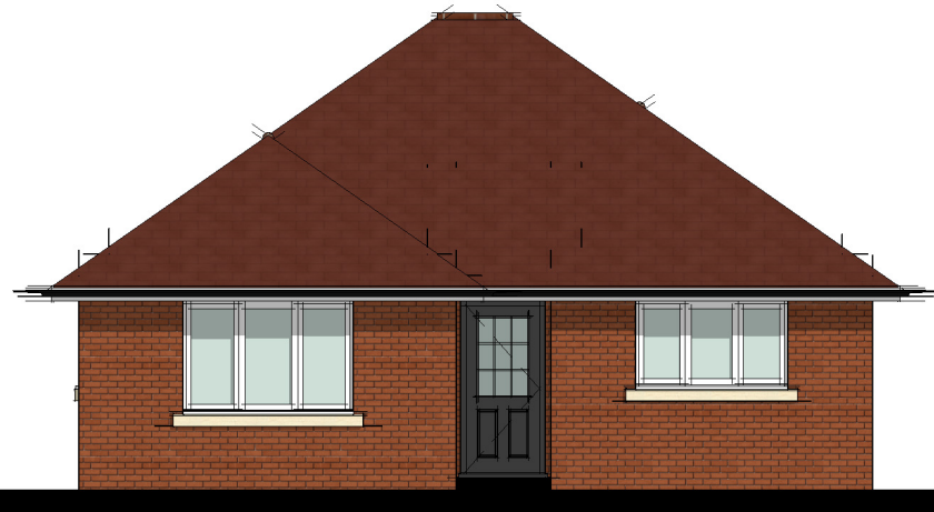
Front 1 : 100