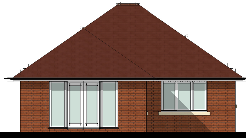
Rear 1 : 100