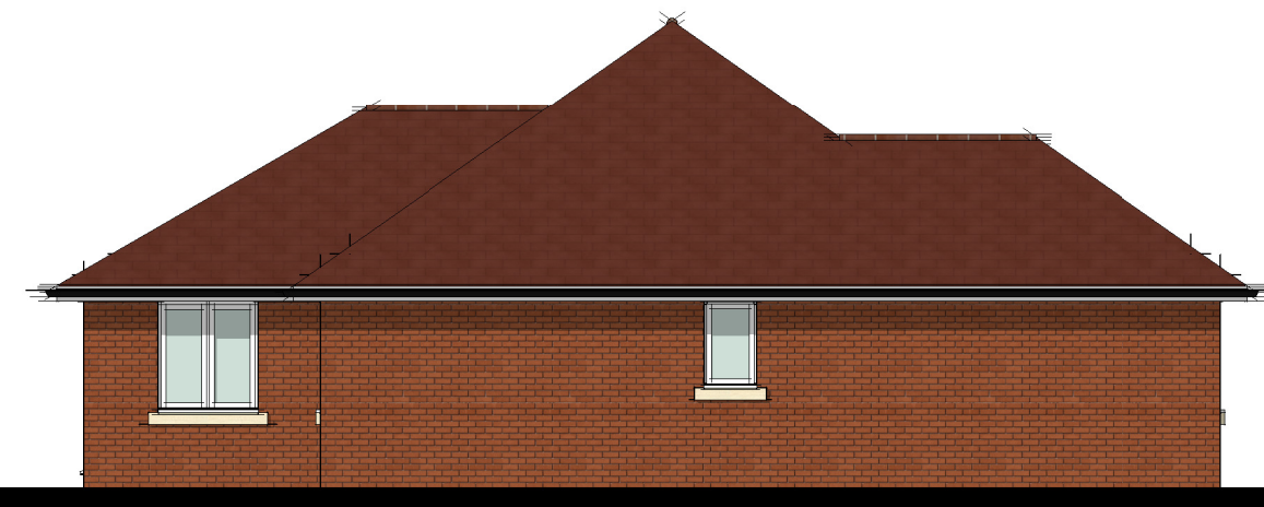
Side 2 1 : 100